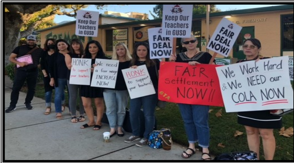
Fremont Elementary (top left), Cerritos Elementary (middle left), Monte Vista Elementary (middle right) and Rosemont Middle School members show their unity during last month's walk-ins.