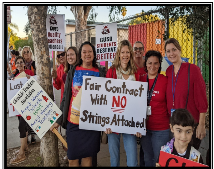
Franklin Elementary School teachers and students show up to support one another!