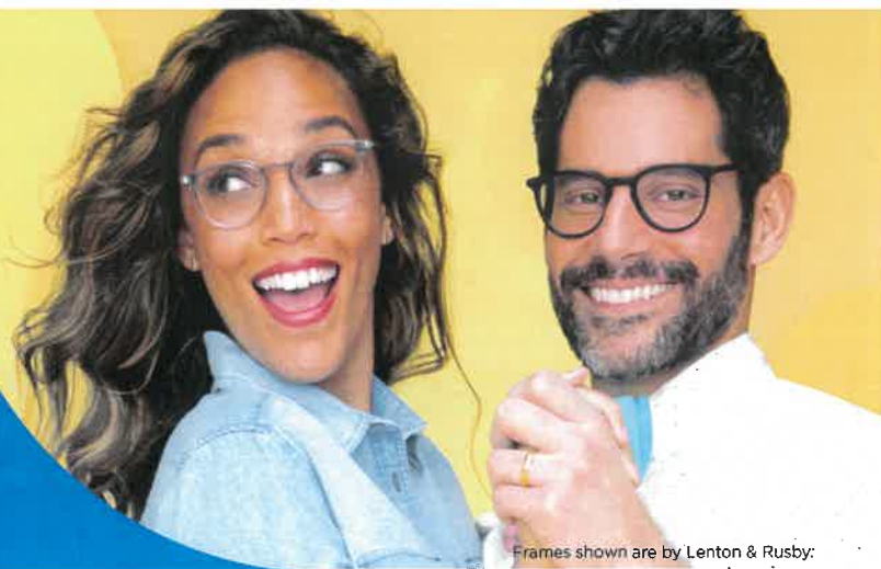
Frames shown are by Lenton & Rusby.

Get access to more than $3,000 in savings from VSP and other popular brands for your eye care and overall wellness needs.